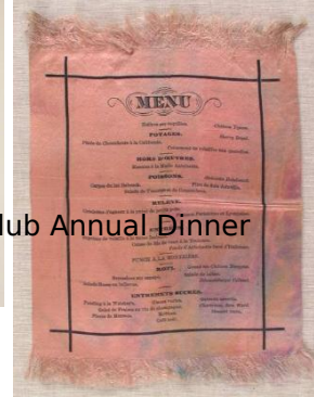
Title: Menu Date: 1850- 1900 Medium: Silk