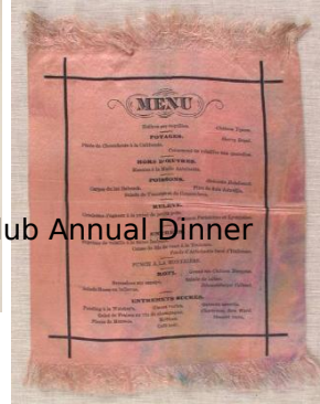
Title: Menu Date: 1850- 1900 Medium: Silk