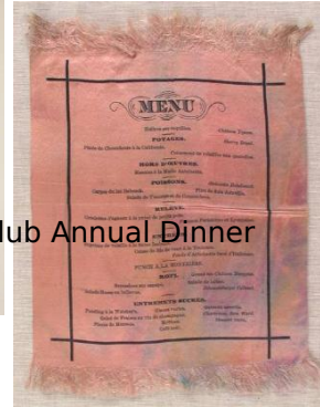
Title: Menu Date: 1850- 1900 Medium: Silk