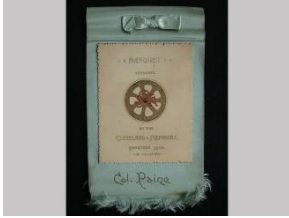
Title: Ohio State Tramway Association Banquet Card and Menu Date: ca. 1889 Primary Maker: Fenton & Stair Medium: Silk, cardboard