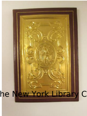
Title: Menu and program: Elihu Root Date: 1906 Primary Maker: Elihu Root Medium: Metal foil, leather, paper, silk moiré