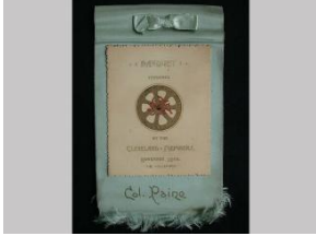
Title: Ohio State Tramway Association Banquet Card and Menu Date: ca. 1889 Primary Maker: Fenton & Stair Medium: Silk, cardboard