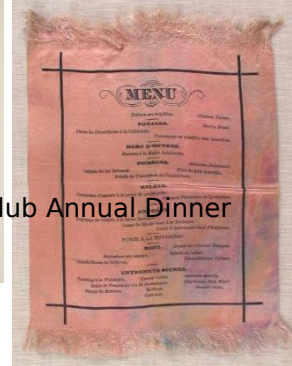
Title: Menu Date: 1850- 1900 Medium: Silk