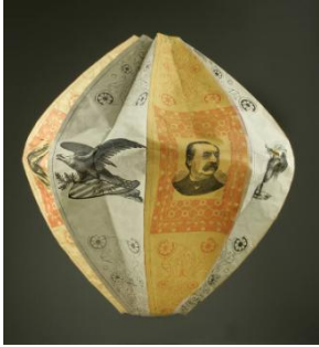
Title: Paper lantern with wire frame Date: ca. 1876 Primary Maker: Sprague & French Medium: Paper, metal, wood, wax