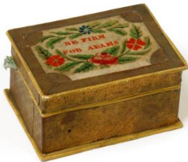
Title: Sewing box Date: 1824 Primary Maker: John Quincy Adams Medium: Silk, paper, paint